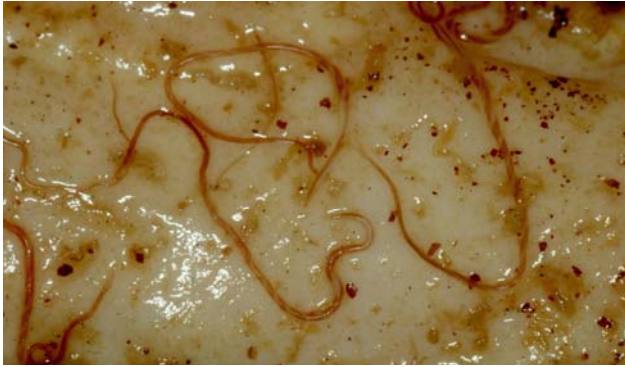
Adult Haemonchus worms on the surface of the