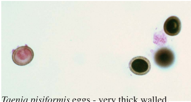
Taenia pisiformis eggs - very thick walled.