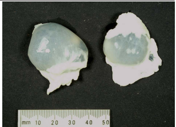
Taenia hydatigena larval cysts from cattle abdominal mesentery. Cysticercus type of cyst.