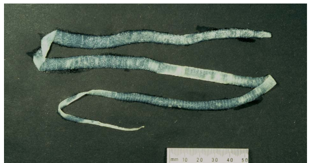
Taenia pisiformis adult tapeworm from intestine of dog final host. A medium sized tapeworm.